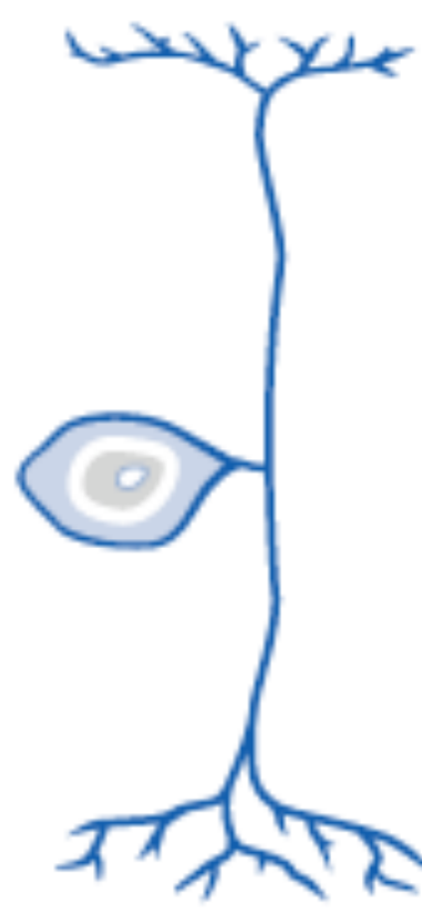
Unipolar (Sensory Neuron)